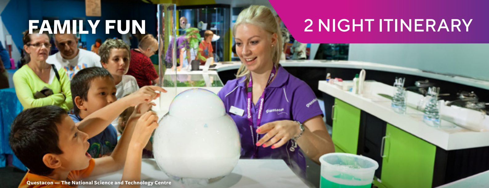
Questacon — The National Science and Technology Centre