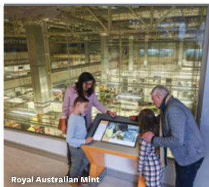
Royal Australian Mint