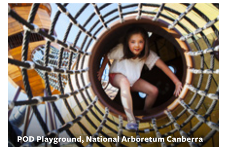
POD Playground, National Arboretum Canberra