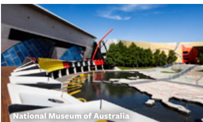
National Museum of Australia