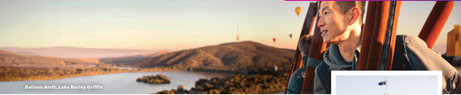
Balloon Aloft, Lake Burley Griffin