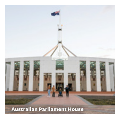
Australian Parliament House