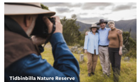
Tidbinbilla Nature Reserve