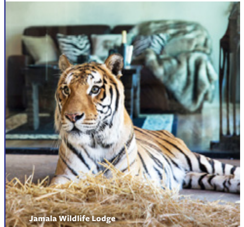
Jamala Wildlife Lodge