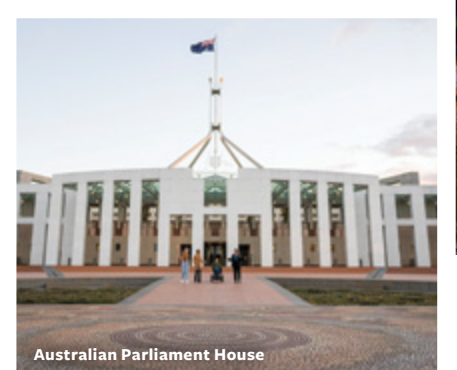
Australian Parliament House