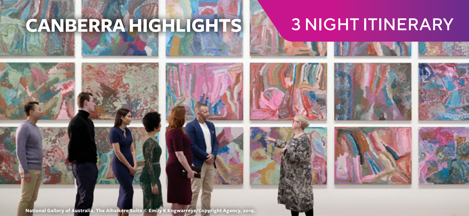
National Gallery of Australia. The Alhalkere Suite © Emily K Ngwarreye/Copyright Agency, 2019.