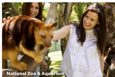
National Zoo & Aquarium