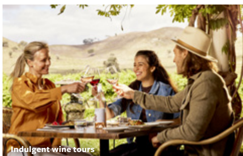
Indulgent wine tours