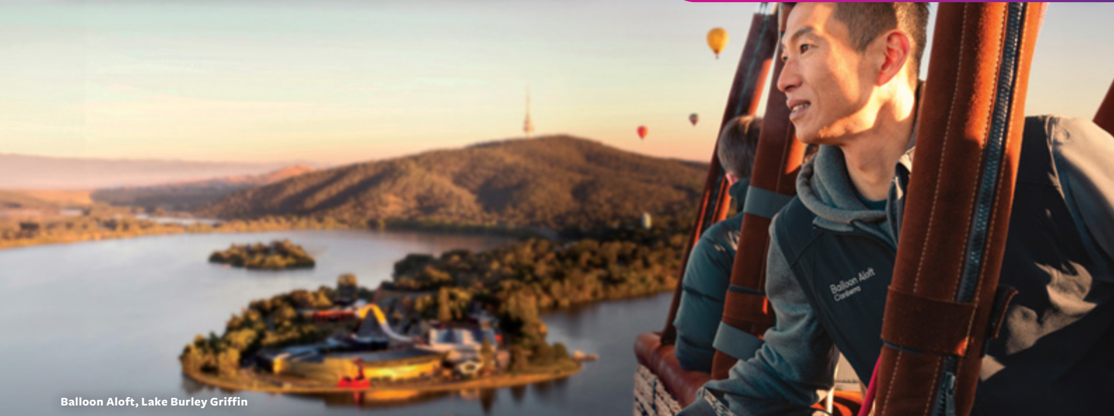
Balloon Aloft, Lake Burley Griffin