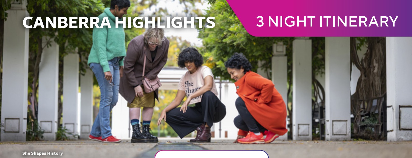
She Shapes History