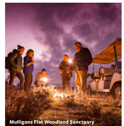
Mulligans Flat Woodland Sanctuary