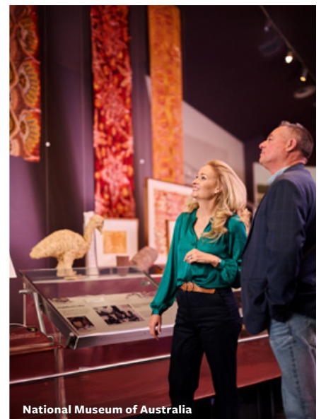
National Museum of Australia