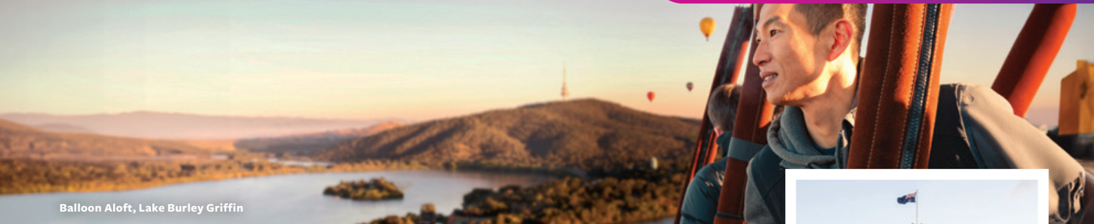
Balloon Aloft, Lake Burley Griffin