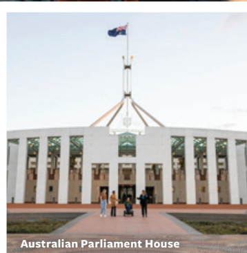
Australian Parliament House