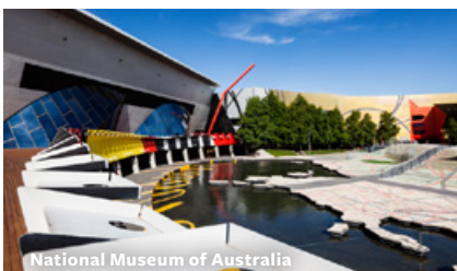
National Museum of Australia