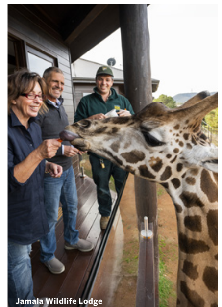
Jamala Wildlife Lodge